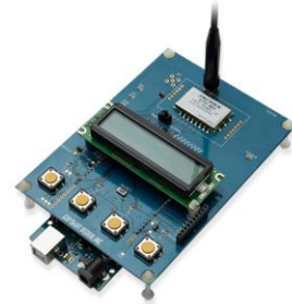
Test board TB-STD601

The details for the TB-STD601 is on our web site.